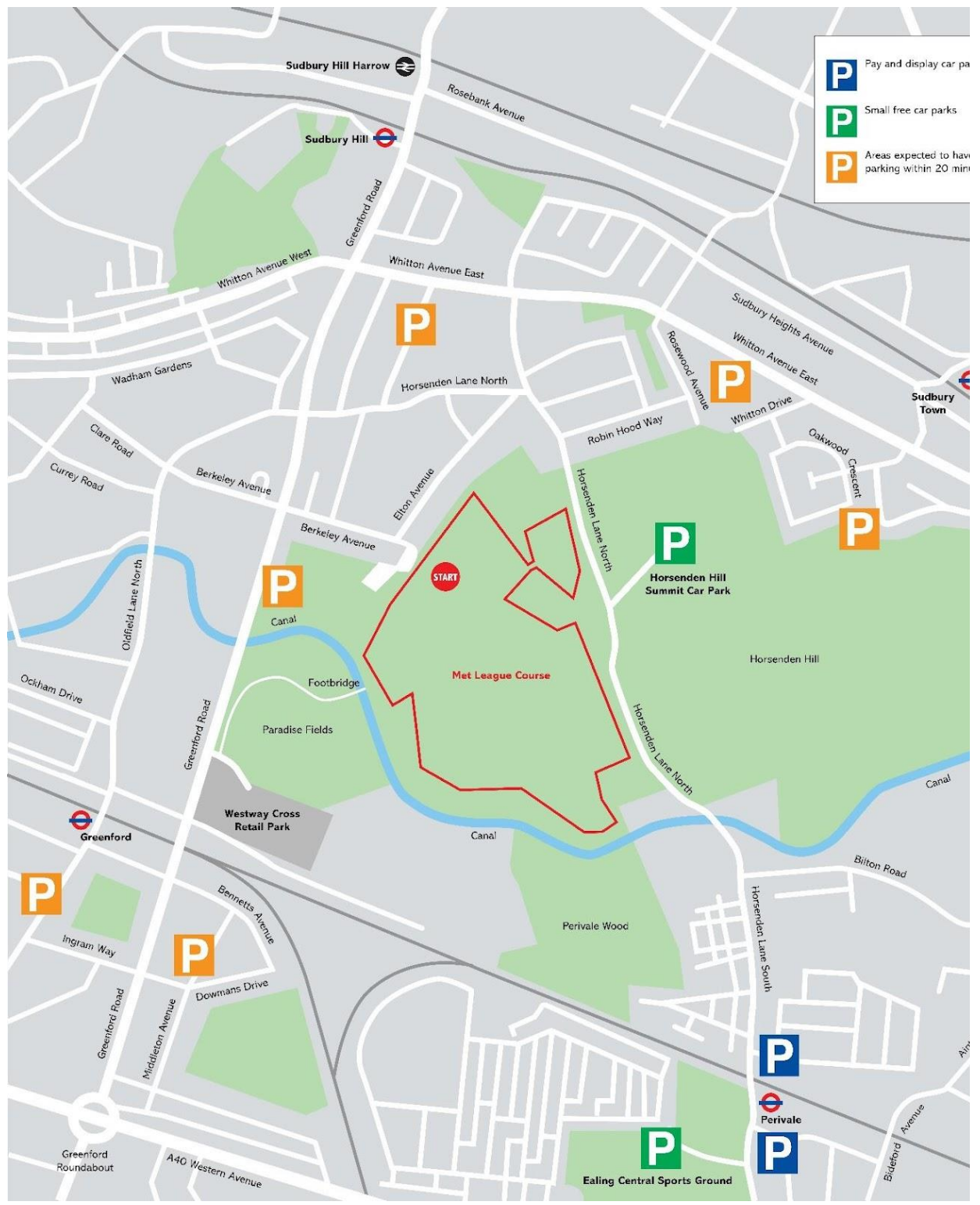
Course Map – Under 11's